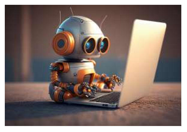
LWML Oregon District Website